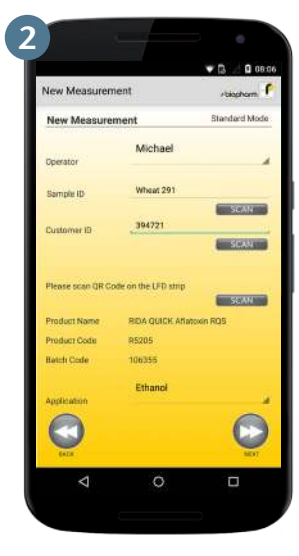
Enter sample data via keyboard or barcode scanner and choose your application