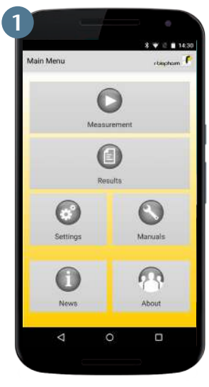
Set your information and choose Measurement