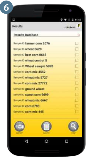
Access and view your results from the built-in database