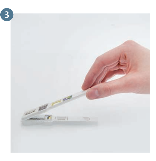
Place the cover on top of the strip