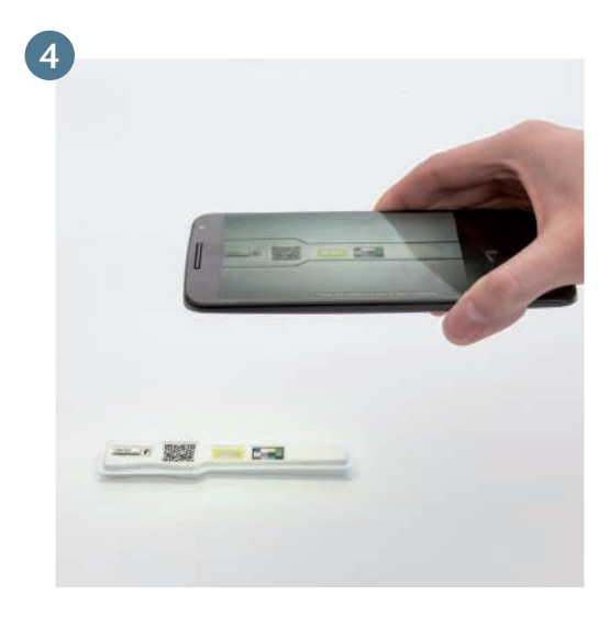
Hold the smartphone above the strip and take a picture