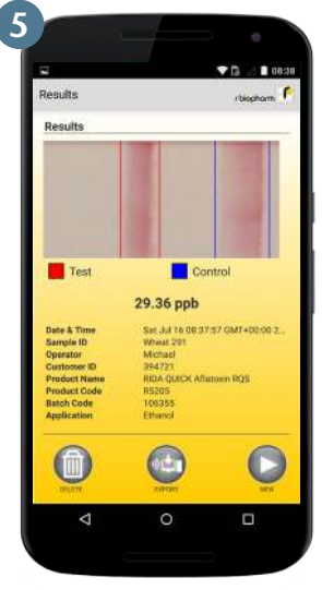
View your results and export them via email or cloud printing