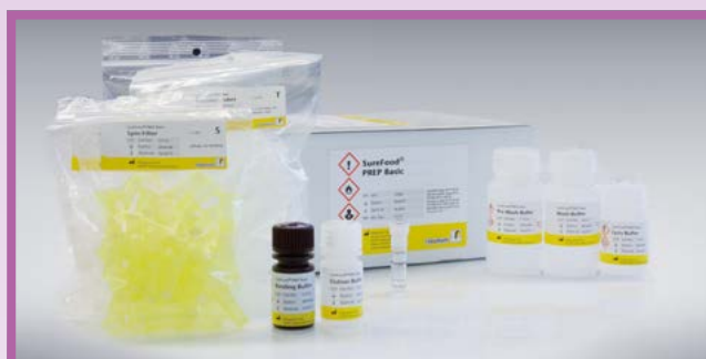
SureFood® PREP Basic