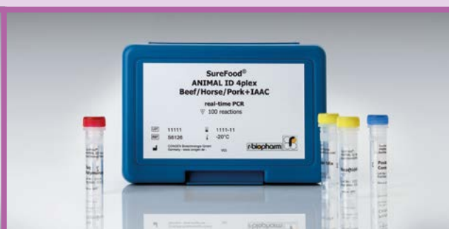
Qualitative real-time PCR Kit